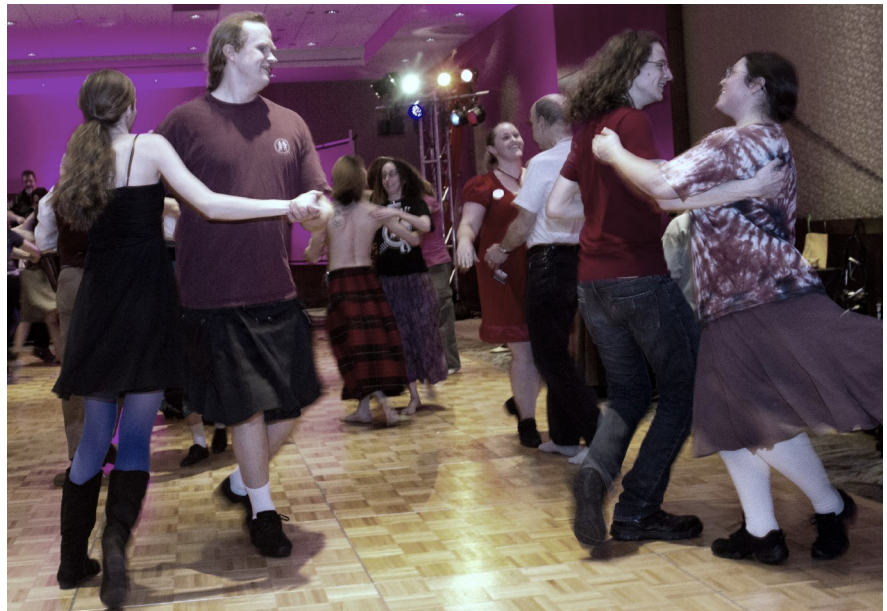
Friday night's contra dance

If Friday night's Drum and Dance was any indication, tonight's Belly Dance Show at 7:00 PM in Grand A should be amazing. On Friday, as the all-ages jam dancing began to fade, several artists showcased their American Tribal dance skills to the ever-changing percussion beats. There were colorful outfits, finger cymbals and mesmerizing synchronized dances. As one artist told me, the style is like a language you can speak anywhere you go. If that was for an impromptu dance, tonight should be amazing.